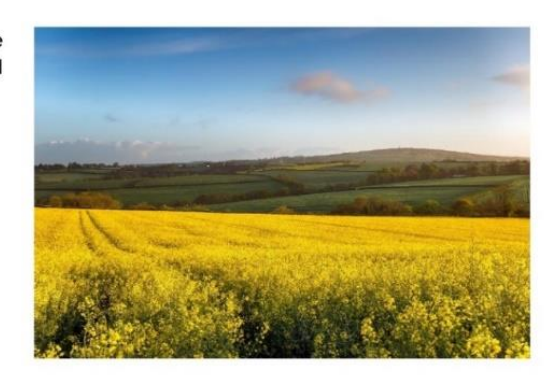
Contact your Rural Professional Team today for expert advice